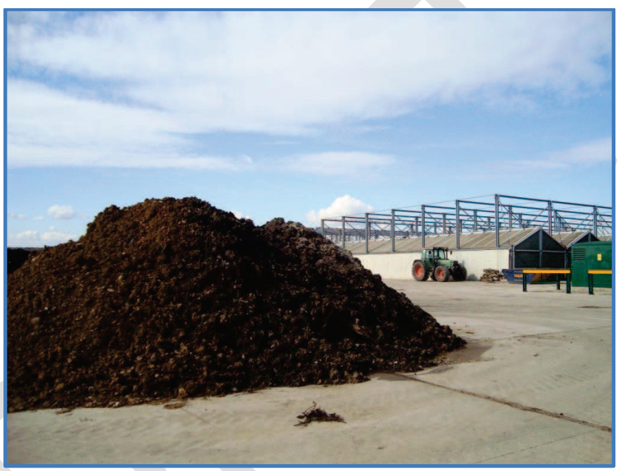
Figure 5 – Compost, produced from biodegradable waste, helps retain moisture in the soil and provides crucial, slow release nutrients