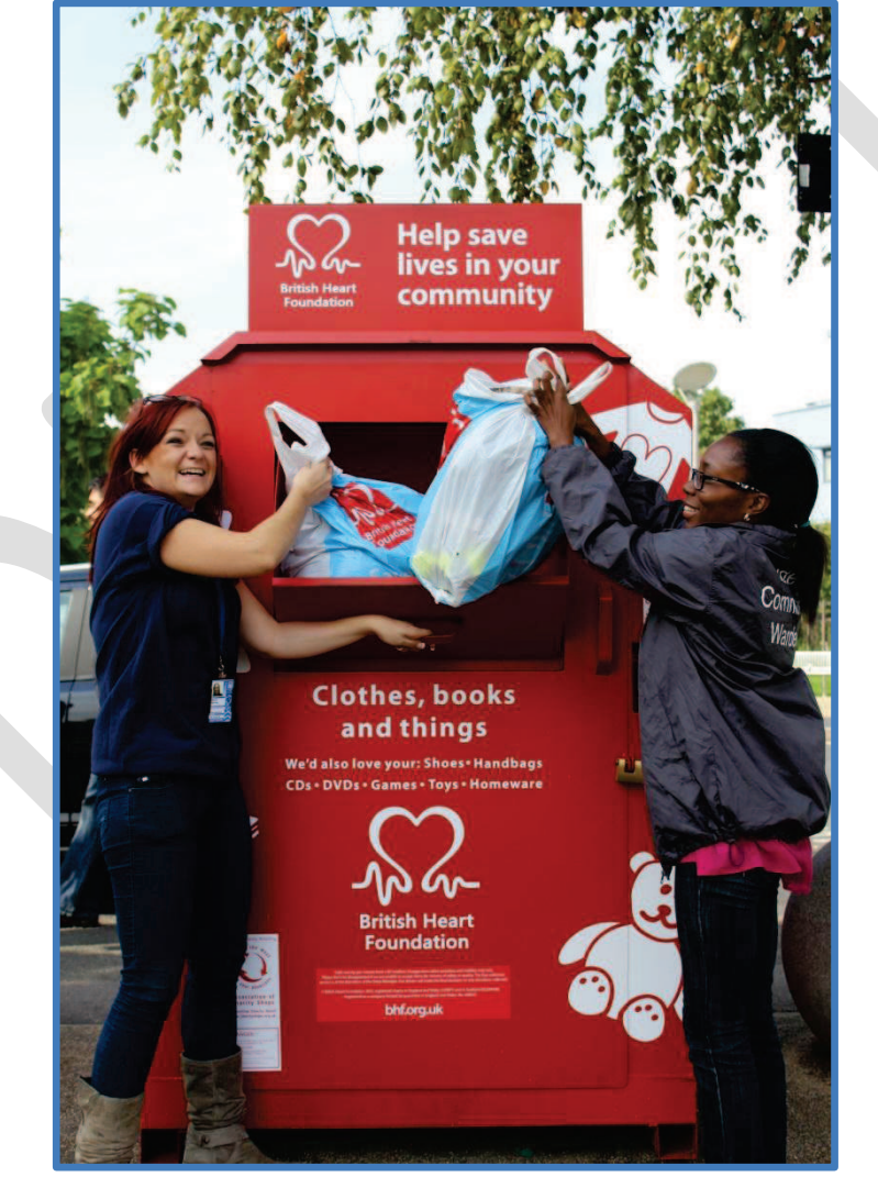
Figure 6 - Recently introduced clothes and textiles banks