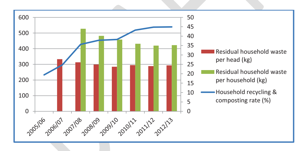
Figure 10 – Graph Showing Oxford City Council's Performance over Time