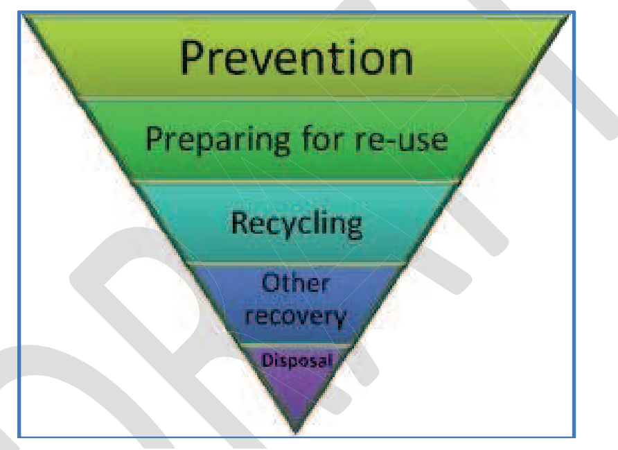
Figure 1 – The Waste Hierarchy

1.13 In Oxford, as in the rest of the UK, we are facing real challenges in dealing with our waste in a sustainable way. Historically the majority of waste we create has been disposed of in landfill sites where it rots down and produces methane, a powerful greenhouse gas.