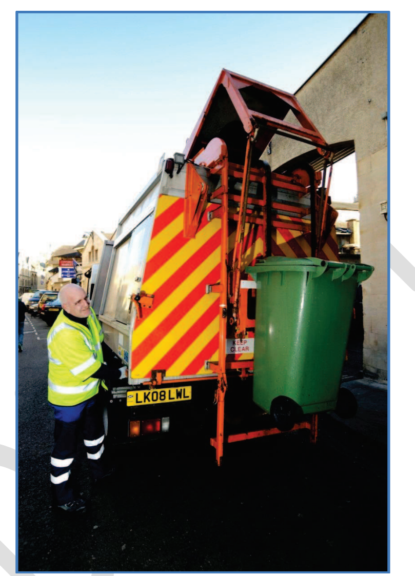
Figure 9 - Business food waste collections

Oxford City Council has a Corporate target to reduce carbon emissions from its activities by a 5% per year until 2016/17.