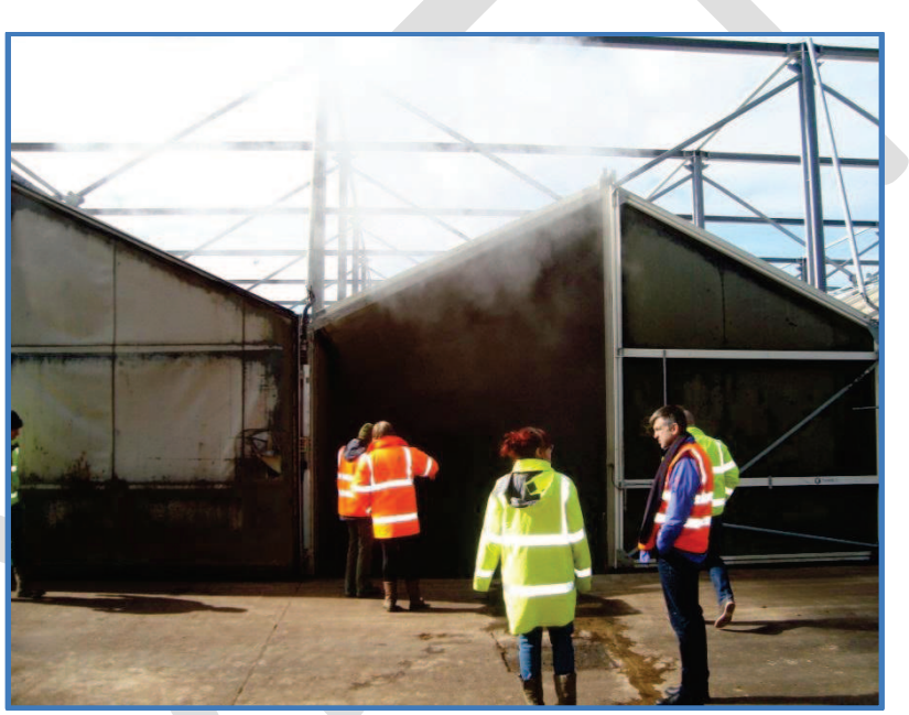
Figure 4 – An educational tour of a waste management facility