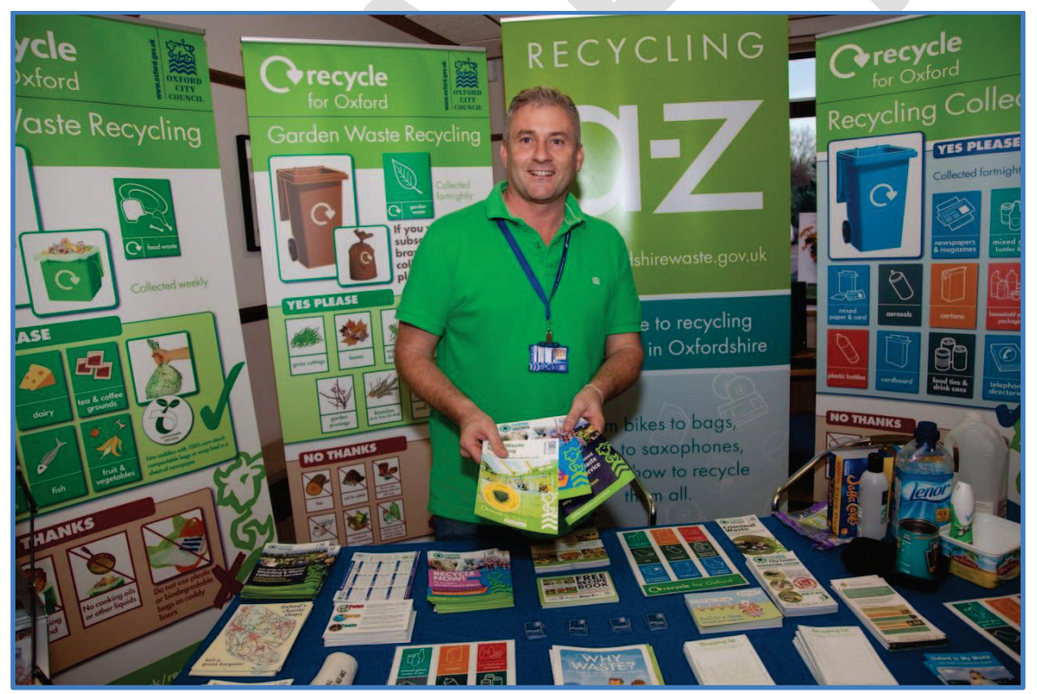
Figure 8 - An Oxford City Council Re-use and recycling road show