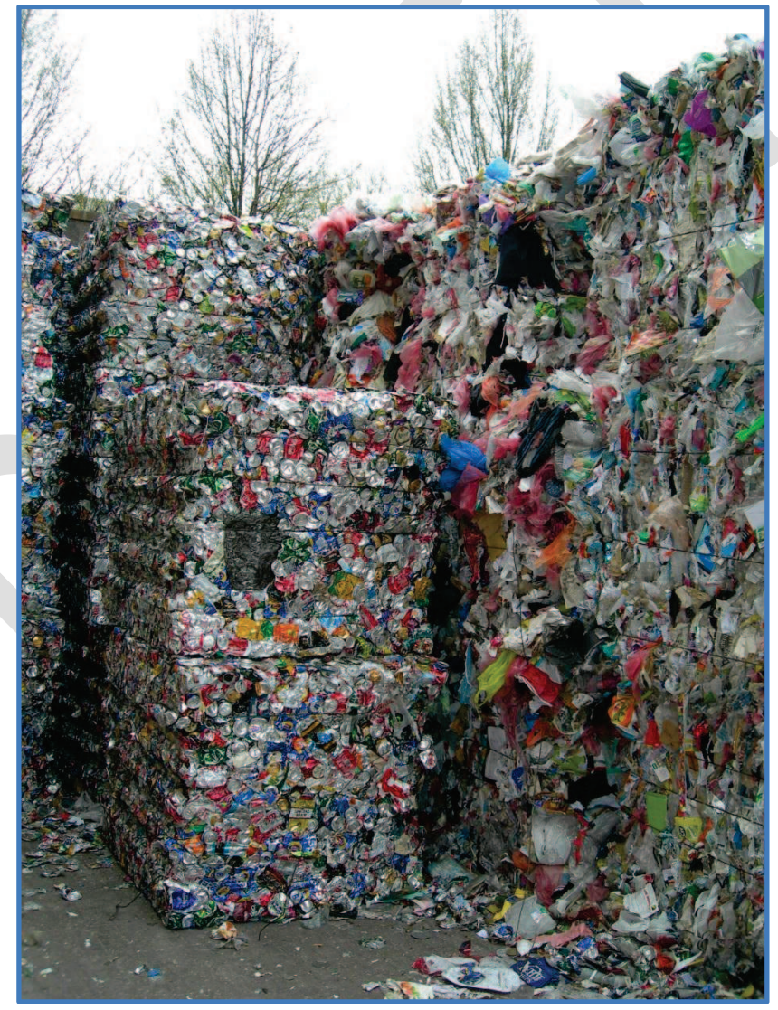
Figure 7 - Bales of recycled materials

It should be noted that although these are the recycling targets recently adopted at City Executive Board the Council still retains an aspiration to reach the more stretching target of reusing or recycling at least 50% of the waste collected.